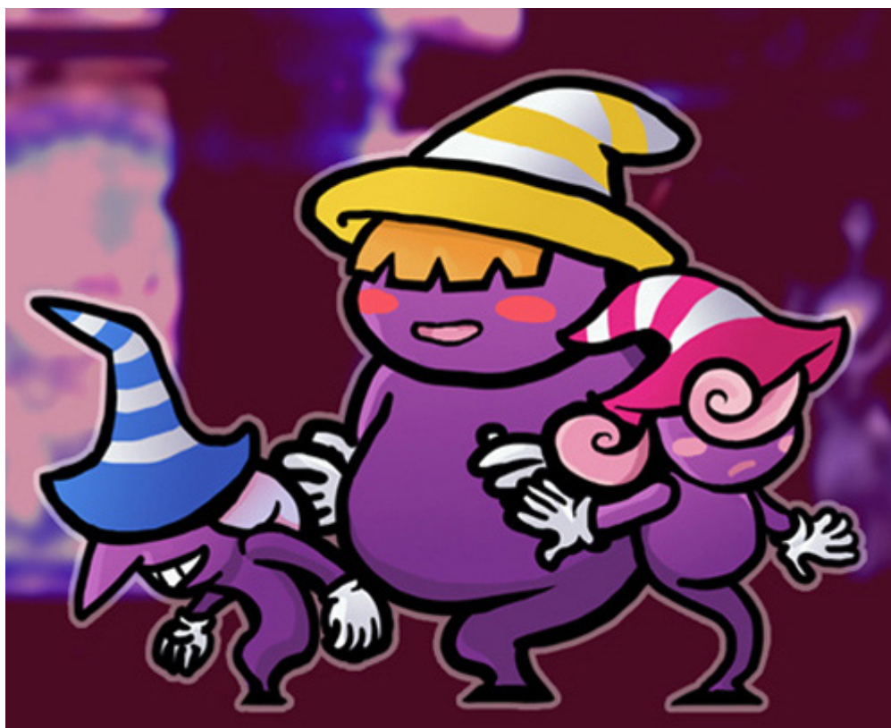
Figure 2. The Shadow Sirens