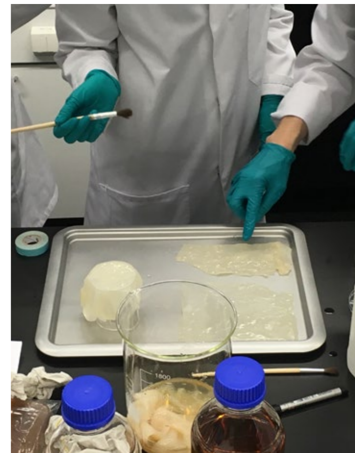
←← Figure 1: One result from participants playing with modelling clay and exploring the material’s behaviour.