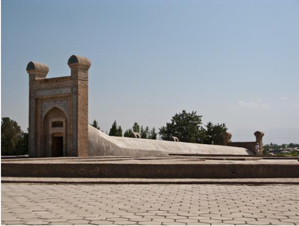
Plate 1: A view of the modern building on top of Ulugh Beg's Sextant.

Gūrkānī Zīj and, now, most astronomers determine the details of the ephemerides using this zīj .