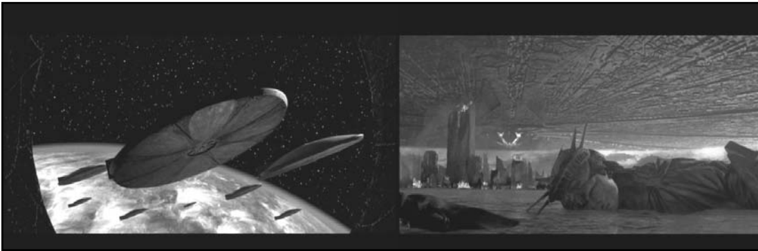
Figure 4. Independence Day