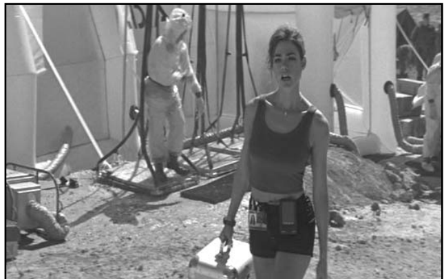
Figure 1. The World is not Enough