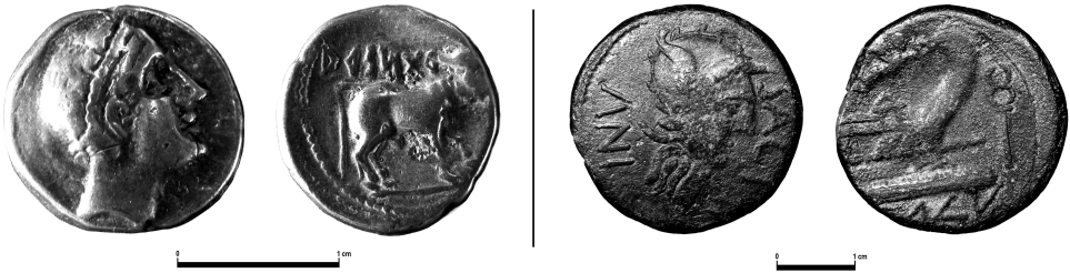
Figura 3. Left: Drachma (218-130 B.C.E.) with the legend arskitar (Museo de Arqueología de Sagunto, Photo: M. J. Estarán). Right: bilingual unit and a half in bronze (130-72 B.C.E.) (Gabinet Numismàtic de Catalunya, n.º 15084, Photo: M. J. Estarán), both from Saguntum .