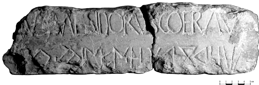
Figura 3. Bilingual inscription from Saguntum (Museo de Arqueología de Sagunto, n.º 91b).

themselves to the broader world, and Latin and/or Iberian in internal contexts. Iberian seems to have retained prestige locally for some time, particularly, perhaps, in the religious domain, as can be gleaned from the inscriptions from the sanctuary of Montaña Frontera. The Saguntine evidence points toward a series of linguistic choices motivated by the élite's desire to present itself in a certain light to the outside world through the circulation of coins) and in a quite different light at home. Latin, then, was originally introduced at the hands of the Saguntine élite, which gave way to a process of «self-Latinization» (there is no evidence of the arrival of a Latin-speaking community in the city) and subsequently its use spread to the broader population.