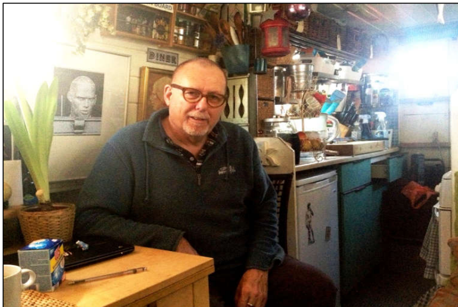
Image Boater inside

Número 21(1), junio 2016 http://revistes.uab.cat/periferia