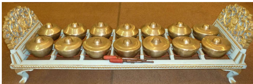
Fig. 6: the gong chime bonang barung

Next, let us look at the melodic patterns of the gong chime bonang barung (fig. 6).