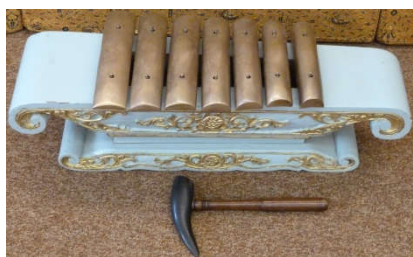
Fig. 2: the metallophone peking

or doubled respectively. Thus, reducing the speed by half will usually imply that the embellishing parts double their density in relation to the balungan beats and these relationships always involve multiples of 2 (2:1, 4:1 and so on). These levels of balungan tempo vs. density of embellishing parts are called iråmå . We will now look at standard settings for which the typical musical behavior of a certain instrument can be expressed in a paradigmatic form. At first, let us consider the highest metallophone, called peking (fig. 2).