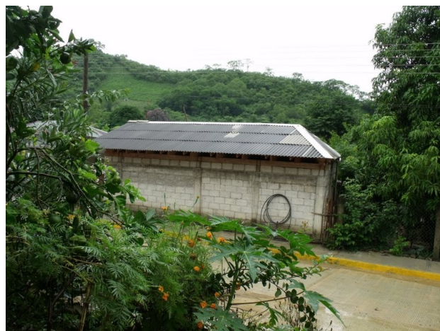
The neighbour's house