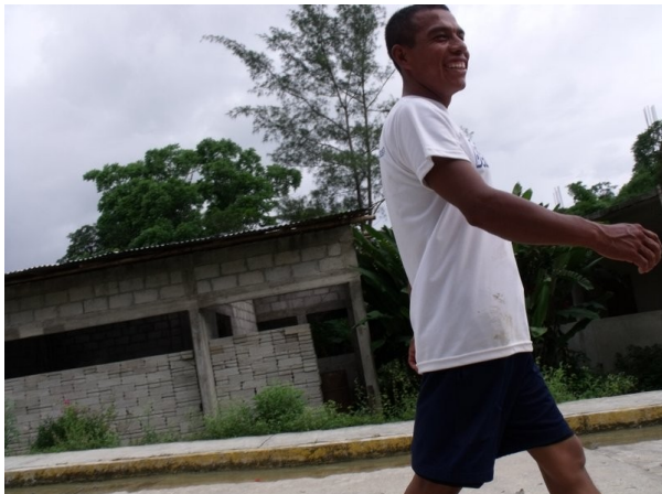
Through photography interaction with passing by adults was possible