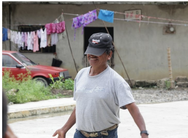
The man responded to the "photo provocation" and "did something"

Another issue that emerged from the photography situations with children was the question of who should be considered the author of those photos. Many of those photos are created during the play; the camera was passed from hands to hands, sometimes the shutter button was pushed accidentally, or by two children at the same time. In these cases it is not possible to define one author, as the pictures are results of the whole group's interaction. In this case I do believe the author is collective. 13