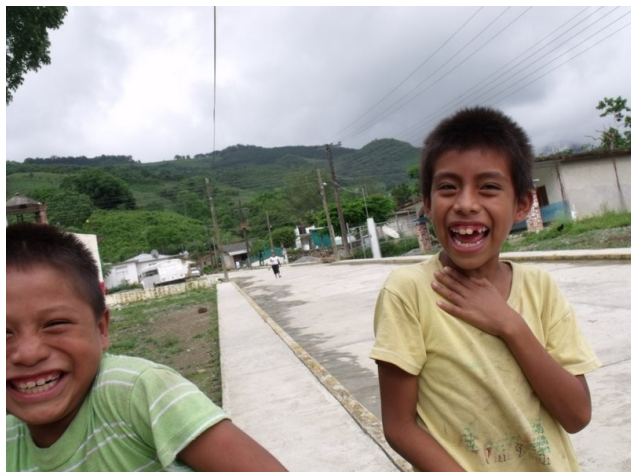
Photography was a tool for fun (photo: Children of Hueycuatitla)