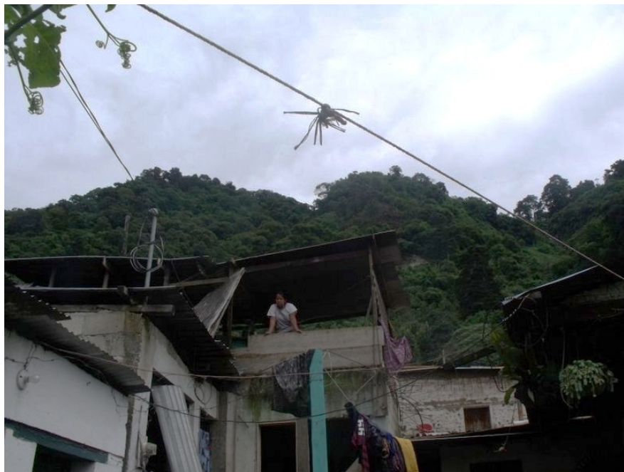
This is my home...