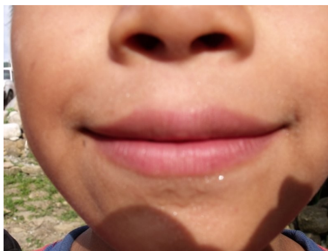
...as well as body details (photo: Children of Hueycuatitla)