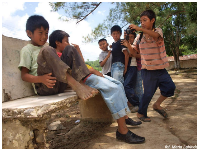
Photography was a tool for interactions