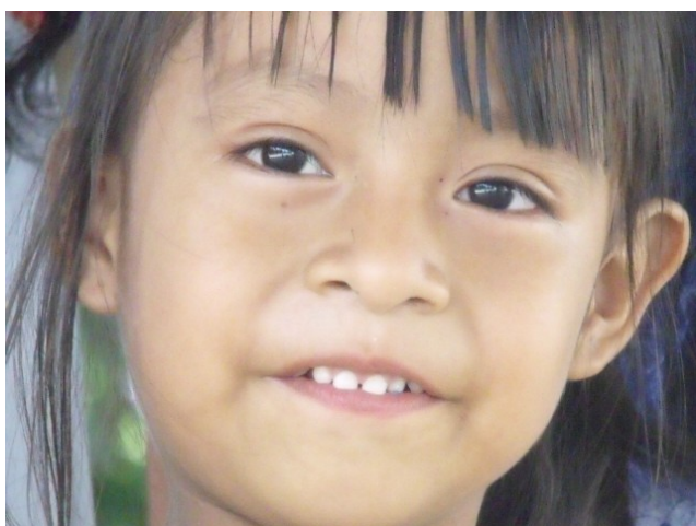
Many face close-ups were taken...