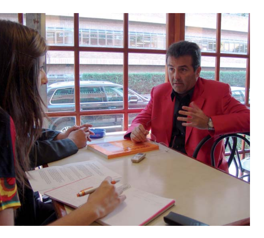
▲ «U.S. GDP per capita is seven times higher than chinese. Perhaps they will converge within fifty years from now.»

to build things that are good for nothing. All workers having left the building branch need to turn to anything different and this has a very high correction cost. A fourth and very important imbalance is unemployment, which in Spain creates permanent imbalance. A 47 or 50-year-old unemployed with a life expectation of eighty years means they have thirty years left doing nothing as they can't be retrained.