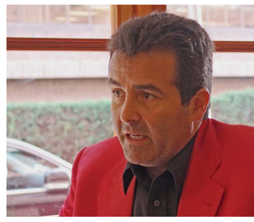
▲ «I think we're in a double-W-shaped crisis, like Bart Simpson's hair.»