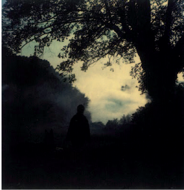
Illustration 7: Detail from a Tarkovsky film.

Nostalghia in Italy and Offret in Sweden. If Bird (2004) was right to claim, with respect to Andrei Rubliov , that the entire film is about what cannot be shown, the same statement can probably be made about poetry, and about all of Tarkovsky's work.