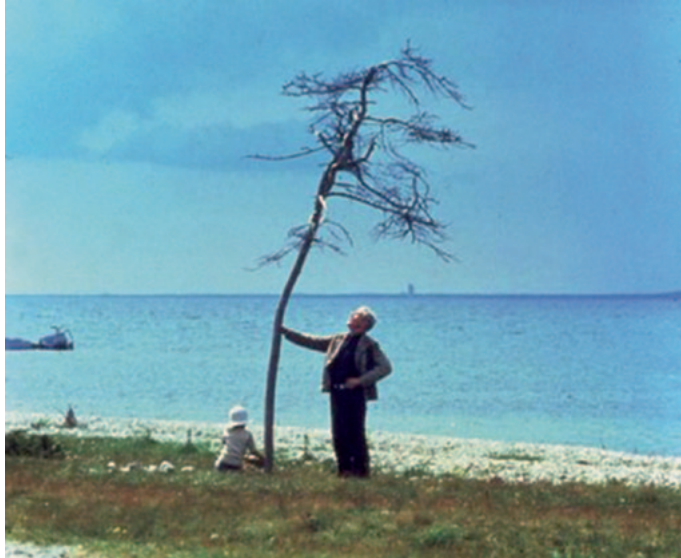
Illustration 12: Alexander and Little Man planting the barren tree.