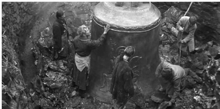
Illustration 1: The young bell maker and his companions.

seems to know much more about local customs, people and events than the other Italian.