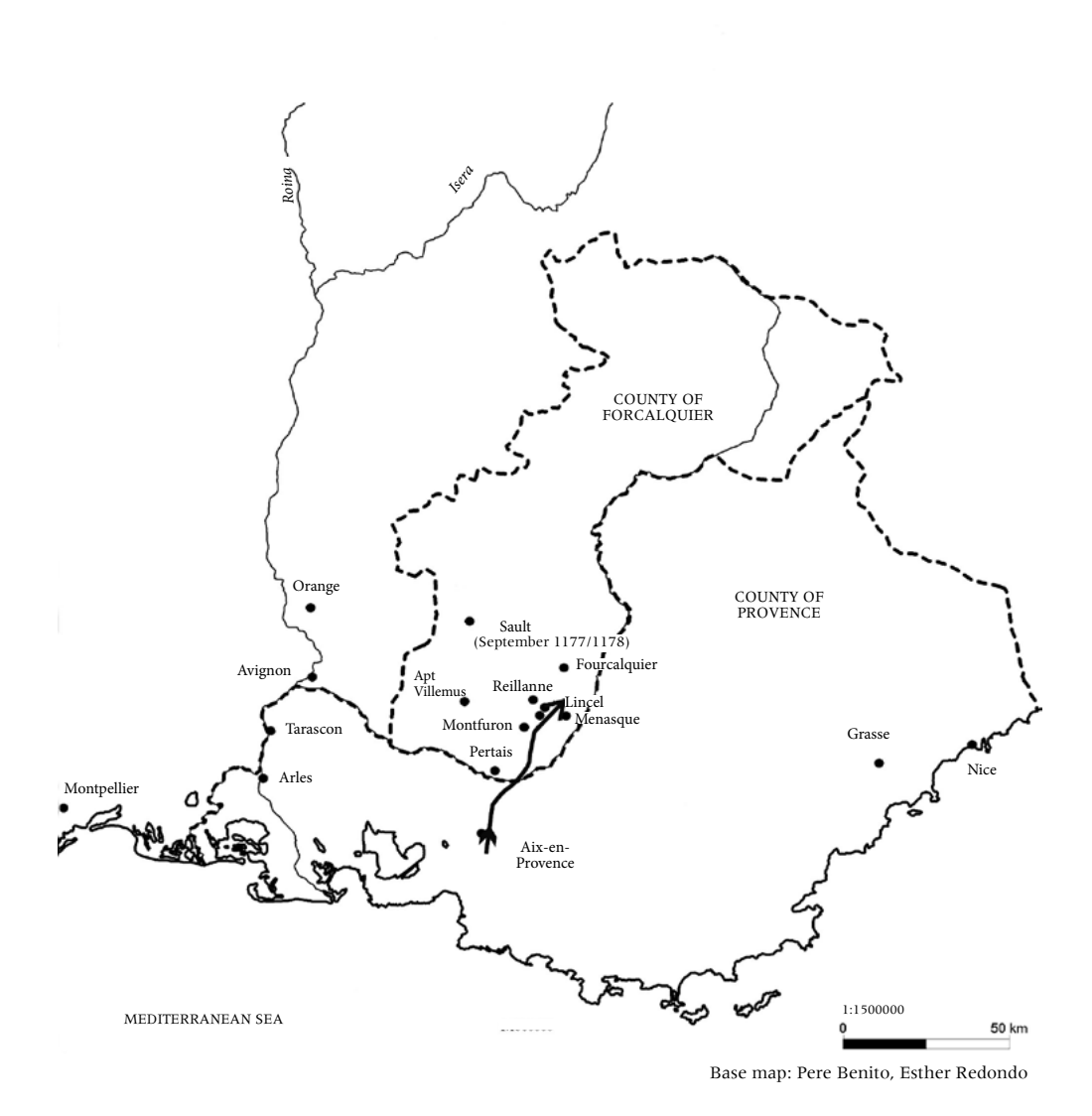
Mape 2: Campaign itinerary of Alphonse the Chaste in Forcauquier (1177/1178).