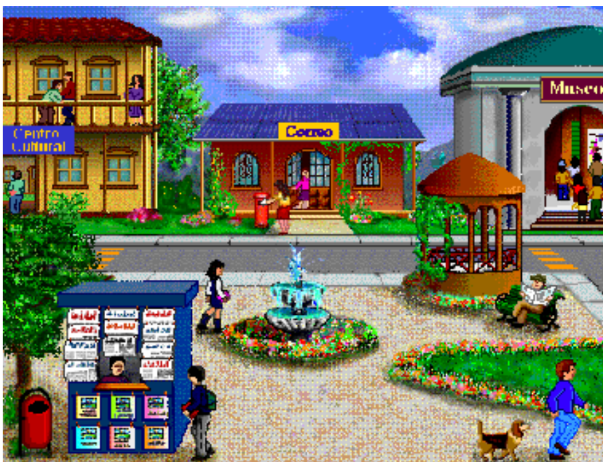
Figure 1: La Plaza occupied the full screen and it appeared automatically when a computer in any school was switched on. Each major icon was an active button that allowed entrance to a specific work environment by just clicking on it.

Consistent with its emphasis on empowering teachers and students through the use of computers and telecommunication, the professional team in charge of Enlaces developed " La Plaza " (Town Square), a user friendly application which enabled easy access to the computer, be it to navigate educational software (mostly multimedia based applications), to take advantage of electronic mailing facilities (to participate in regional, national and international educational projects); or simply, to deliver and receive information of personal interest over the network. As its name suggests, this application consists of a graphic depiction of a town's main square. Through icons which are buildings which are a familiar sight in most Chilean cities and towns, the software provided four different work environments: a Post Office, a Kiosk, a Museum and a Cultural Center (Hinostriza et al. , 1995). A brief description and illustration of these environments is as follows.