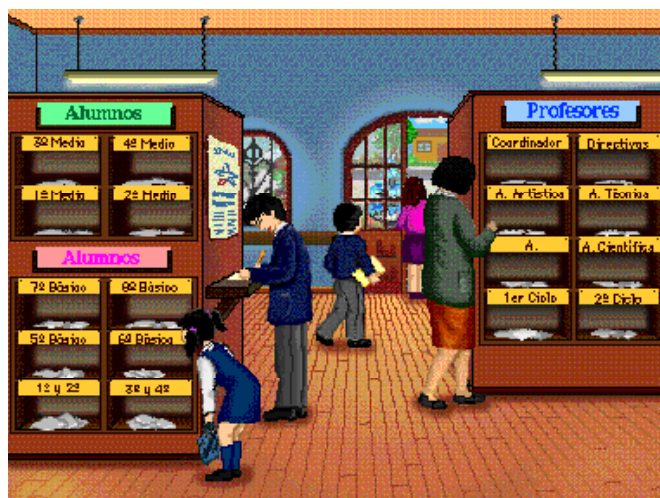
Figure 2: Clicking on any mailbox would bring up a listing of all messages received in that collective inbox. Individual recipients could be identified in the “subject” field. Clicking on the writing stand would open-up a sheet of stationary, along with an airmail envelope to be filled out.

in the out-box of every active school in the Enlaces network. Once the desired address was found by scrolling down the list, one click of the mouse would transfer it to the envelope and another click would place the envelope into the outgoing mailbox.