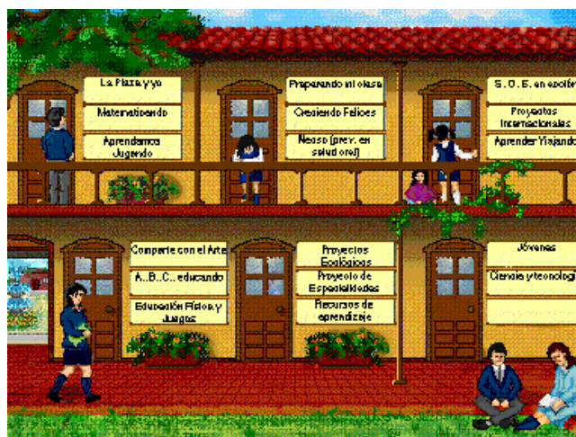
Figure 5: The inboxes at the Cultural Center were activated and replaced every school year, depending on the projects and discussion groups that were to be initiated.

3.2.4 The Cultural Center. This was a meeting place, a sort of civic center, where collaborative projects among the students and teachers from different schools could be developed and run. It was also a place to provide a directory of ideas, work materials and