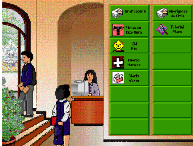
Figure 4: Clicking on an icon on the display panel would start/open the corresponding application, leaving it ready to use or to navigate across it. Once the user was finished, closing the application would return the “museum” interface. To exit the “museum”, or any of the other work environments, the users had to click on the water fountain from La Plaza

could start using software without having to deal with the machine's operating system. Some of the preferred software packages during the early years of Enlaces were “Kid Pix” (by Broderbund), “ClarisWorks” (by Claris), “The Living Books” (by Broderbund), “Grolier Encyclopedia, Decisions” (by Tom Snyder), “The Human Body” (by Enlaces ), amongst others.