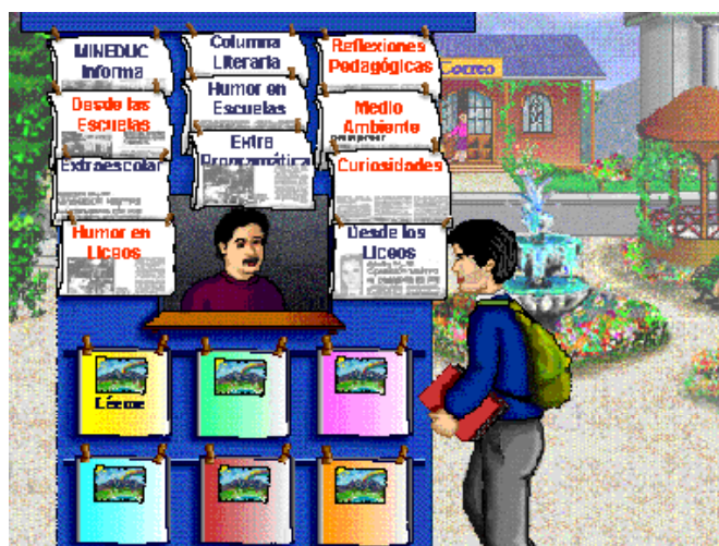
Figure 3: At the kiosk, contributions were written in a similar way as in the Post Office, but here, the messages were broadcasted simultaneously to kiosks in all schools.

3.2.2 The Kiosk. This environment consisted of a dynamic bulletin board. Electronic newspapers were constantly produced and distributed by teachers and students through