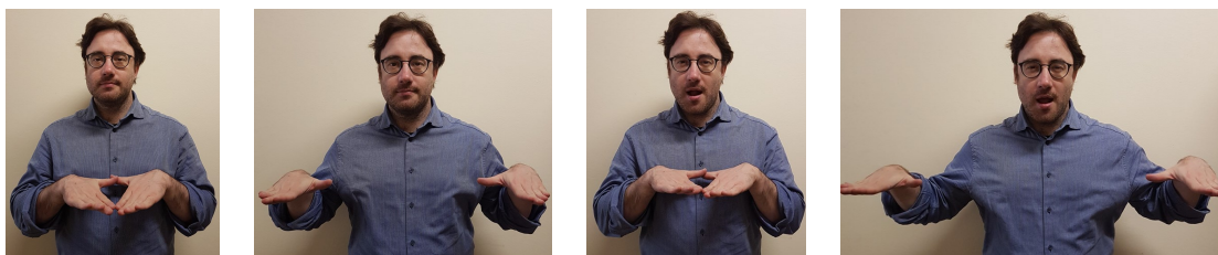
TABLE 'a big table'