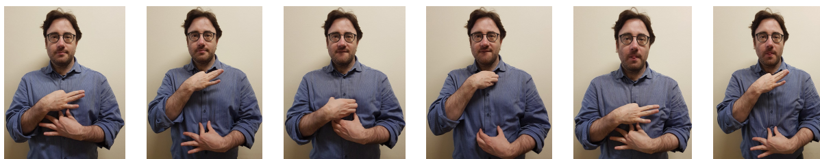
a. TIE 'a tie'