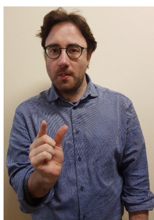
dim THING 'a small thing'

(iv) reduplicative evaluation consists of the partial or full reduplication of the base sign. Specifically, in order to convey augmentative features the copied portion following the base sign can display an enlarged articulation, as shown in example (6).