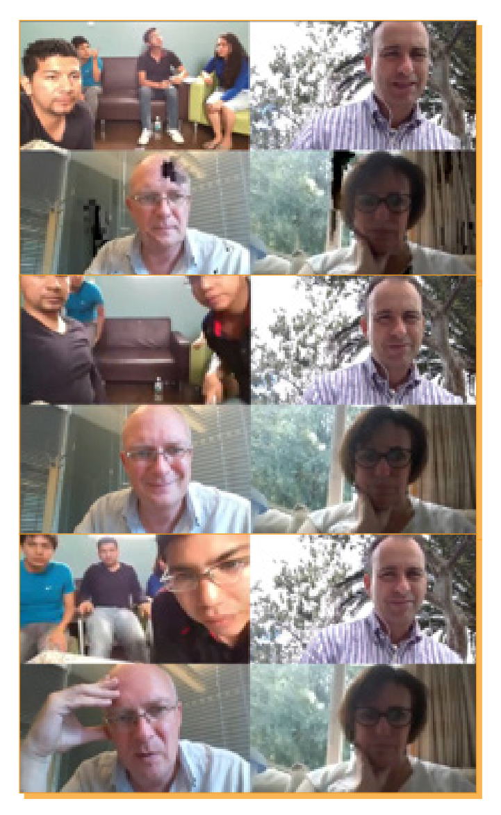
Figure 7 Group mates' embodied behavior

with "Si" (line 19, Yes) and "Vale" (line 22, OK), to confirm that he understands what the problem is. "Vale" presupposes a version of "yes" as an answer. This co-participation in the contextual frame created by Jordy's immediately prior action is displayed not only in the content of what is said in lines 23 and 25, but also through group mates' embodied behavior (Fig. 7).