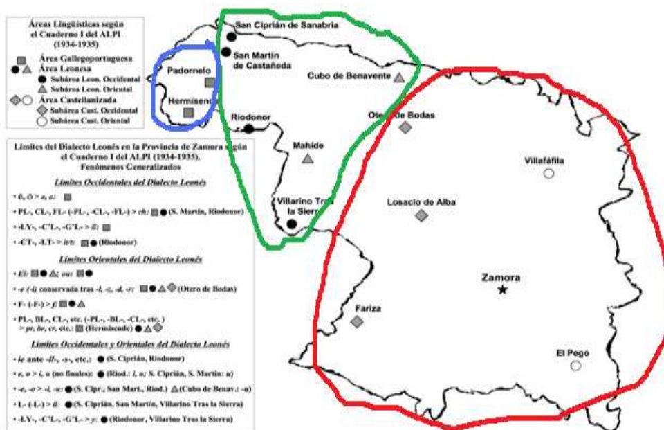
Figure 2. The three dialectal areas of Zamora province according to González Ferrero (2007: 200).

González Ferrero's (2007) study establishes the boundaries of the Leonese dialect in the province of Zamora at the beginning of the twentieth century and the different areas and subareas by using data from the ALPI Cuaderno I questionnaire. An in-depth analysis of each of the thirteen phonetic features chosen by this author and the comparison of his results with other previous studies allows González Ferrero to create a map with the precise limits of the Leonese dialect and to identify three different dialectal areas in the province. Figure 2 shows these three areas: Galician-Portuguese (in blue), Leonese (in green) and Castilian (in red).