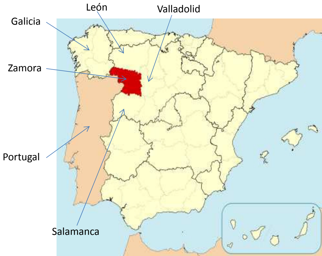
Figure 1. Zamora 4

Zamora province is located in the Northwest of Spain and belongs to the autonomous region of Castilla and León. This province borders with León province to the North, with Valladolid province to the East, with Salamanca province to the South, with Portugal to the West and with Orense (province Galicia) to the Northwest. It is this location between the province of León with its own dialect (Leonese), Galicia and Portugal with their own languages (Galician and Portuguese) and the two Castilian provinces of Salamanca and Valladolid that makes of Zamora an ideal place for dialectology and language contact research.