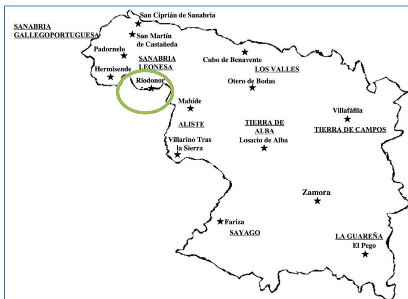
Figure 4. Zamora province survey points in the ALPI (González Ferrero 2007: 170).

González Ferrero (2007) includes the thirteen points in Figure 4 in his study. Here, however, I have decided not to include the data from Riodonor (circled in Figure 4). This village is on the border between Spain and Portugal and, according to the ALPI searchable database online, 6 this point is not among the points surveyed in this province. 7 Additionally, on page three of the Cuaderno I for this locality, the surveyor explains that at the time of the survey there was a “ Rio de Onor de Portugal ” on one side of the border with 40 inhabitants and a “ Rio de Onor de Castilla ” on the other side with 15 inhabitants and that there were close ties among the inhabitants of these two communities (e.g. marriage between members of both communities and properties on both sides of the border). If we take into account a mainly Lusophone population (40 vs. 15), the close ties between the two villages and the fact that the parents of the female speaker interviewed were Portuguese, it is easy to understand why the data from this point showed a high degree of Portuguese influence and why I chose to not include them.