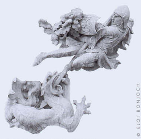
SANT JORDI CASA AMETLIER, BARCELONA.

Saint George has had links with Catalonia from the very beginning. A thousand years ago, when Catalonia was taking shape, the cult of this saint spread with the reconquest of new territories by the Counts of Barcelona. Ever since then, the