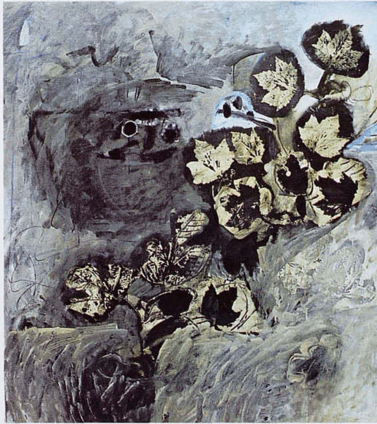
ANTONI CLAVÉ. LE VOYEUR. 1973

When the economic situation in Western Europe improved and economic growth took off during the sixties and until the oil crisis, many Catalans left to work in France, Switzerland, Germany, the United Kingdom, the Benelux countries, etc.