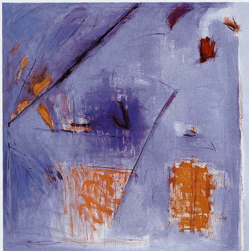
RÀFOLS CASAMADA. VIATGE DE NIT. 1985. PROPERTY OF THE ARTIST. BARCELONA