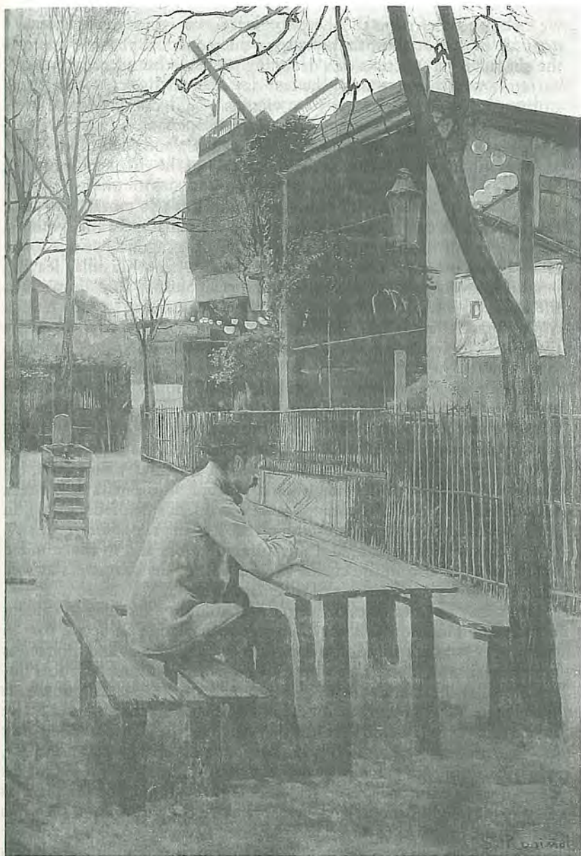
FIGURE 2: «EL MOULIN DE LA GALETTE» EN SANTIAGO RUSIÑOL, POR ISABEL COLL. ED. AUSA, SABADELL, 1992 P. 226