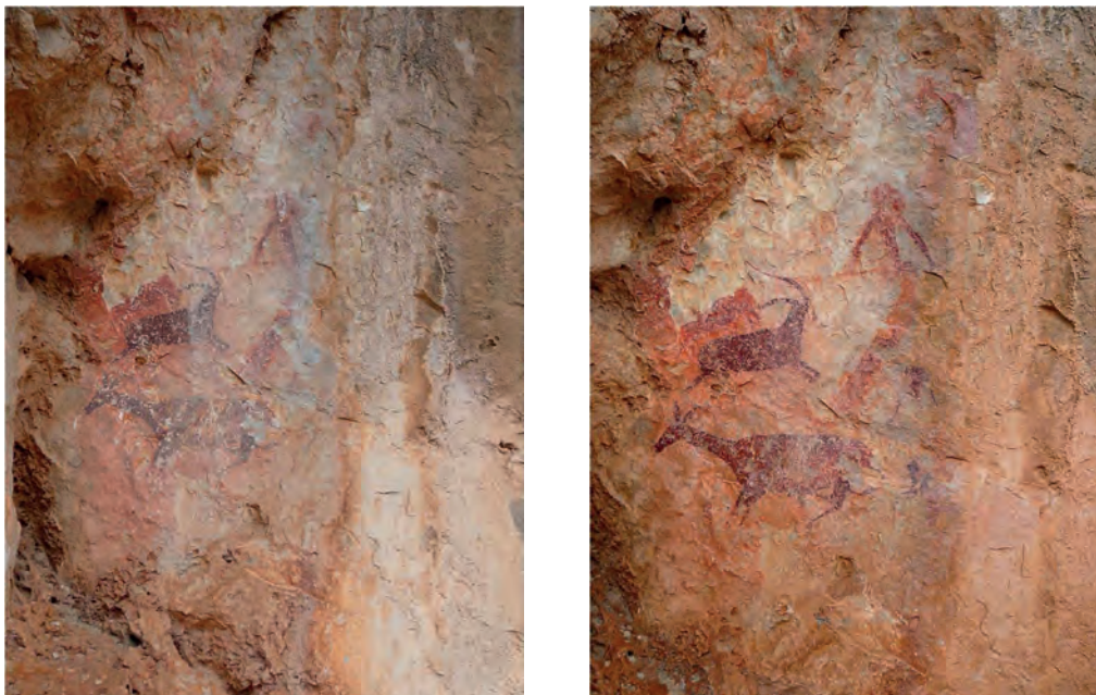
Figure 7. Painted panel in Cabra Feixet before and after the cleaning intervention.

the fingers can be clearly identified, as well as the entire string of the bow he is holding.