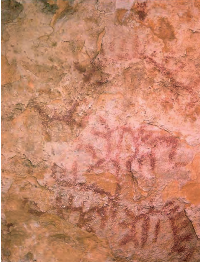
Figure 1. El Portell de les Lletres (Montblanc, Tarragona).

set of rock paintings currently known as El Portell de les Lletres (Montblanc, Tarragona).