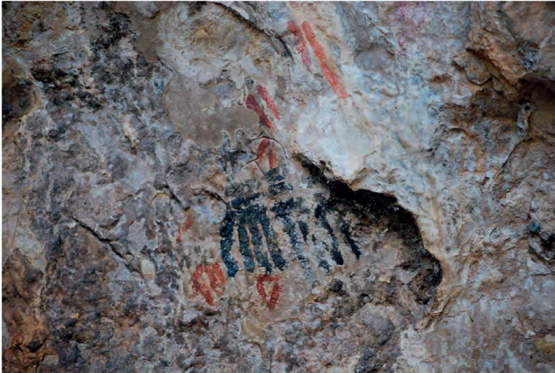
Figure 6. Schematic art. Barranc de Carbonera (Beniatjar, Valencia).

In fact, through their association with other motifs, some of these motifs date from later, which would also corroborate the portable record from the late Neolithic and Eneolithic.