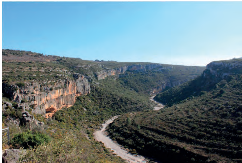
Figure 5. Barranc de la Valltorta. Visibility from Mas d'en Josep (Tírig); in the background, the La Saltadora shelters (Coves de Vinromà, Castellón de la Plana).

(Obón, Teruel) has also been identified in other shelters in Teruel, Alicante, Murcia and Albacete. With regard to other motifs, we could cite the scenes of clashing humans, male and female representations, a woman next to a man's corpse in Abric Centelles, the discovery of a new tree in La Sarga and the spatial distribution of certain animals, such as boars and bovids, which must be a continuation of other animal depictions. In a similar vein, restudying the human figure as I. Domingo Sanz did or some of the objects like arrowheads is also of vast interest. The most unique contributions are unquestionably related to the composition and internal structure of the scenes, and one example worth pursuing further is the studies performed in Cova dels Cavalls (Tírig, Castellón de la Plana), which stands out at the Valltorta site.