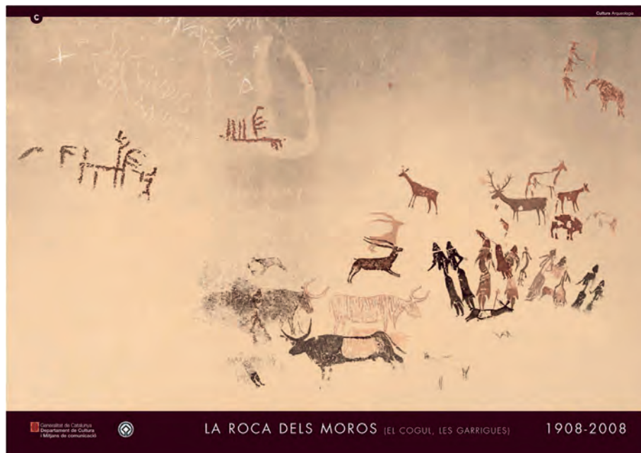
Figure 8. Poster of El Cogul published to celebrate the centennial of its discovery.

Perelló) as part of the Corpus of Rock Paintings of Catalonia project, the only one of its kind on the Iberian Peninsula, Catalonia embarked upon a pathway which all the other autonomous communities have followed, albeit to uneven success. 45