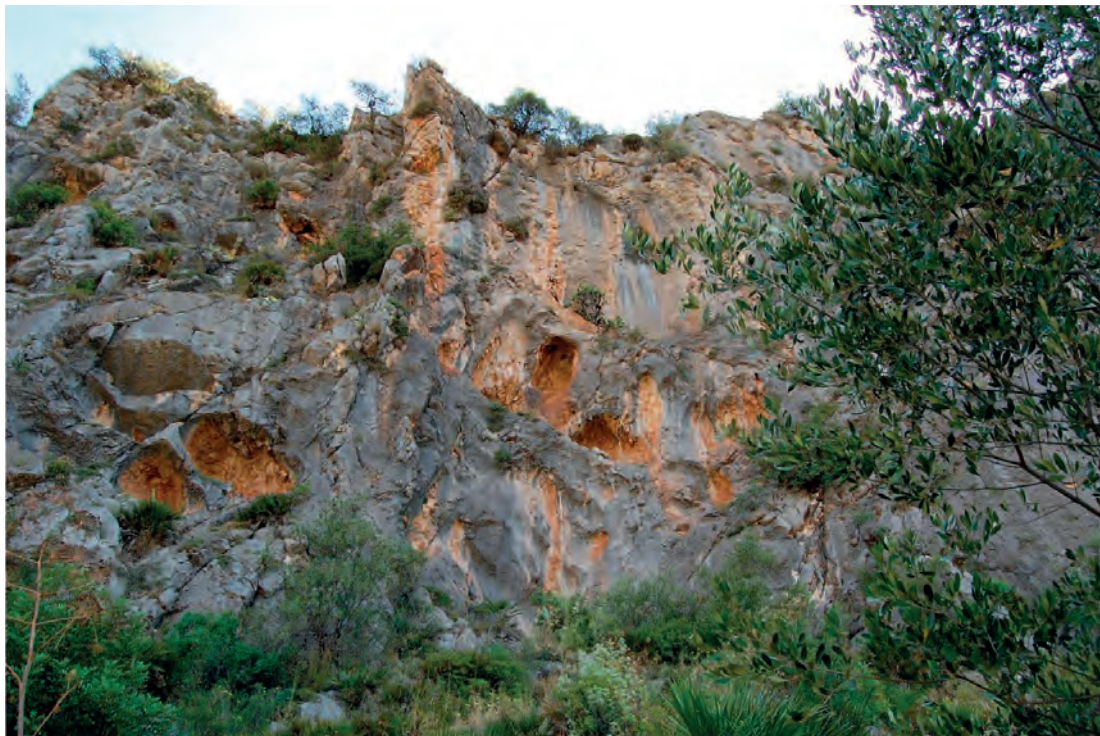
Figure 4. Shelters in Pla de Petracos (Castell de Castells, Alicante).

rations in Or, La Sarsa and La Falguera, where the X and double Y anthropomorphs are also associated with schematic art. 26