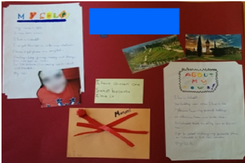
Fig. 5. Example of PBL output

production. Students will usually try to make a bigger effort in this final part because this is what other students and families will see. Incidentally, something very similar to the note-taking before writing took place during the production of the final product: two students did not make a final product in CBD. In that case, they took notes before writing and they also wrote a draft but, in the end, they did not deliver a final product to be corrected and displayed in the classroom whereas, within the PBL approach, all the students finished their final product.