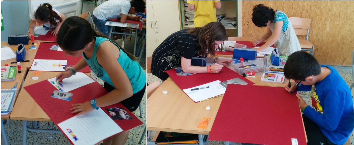
Fig. 6. Students complete their final output for PBL approach

They even video 1 recorded themselves explaining things about their favourite object, clearly indicating student engagement in the project.