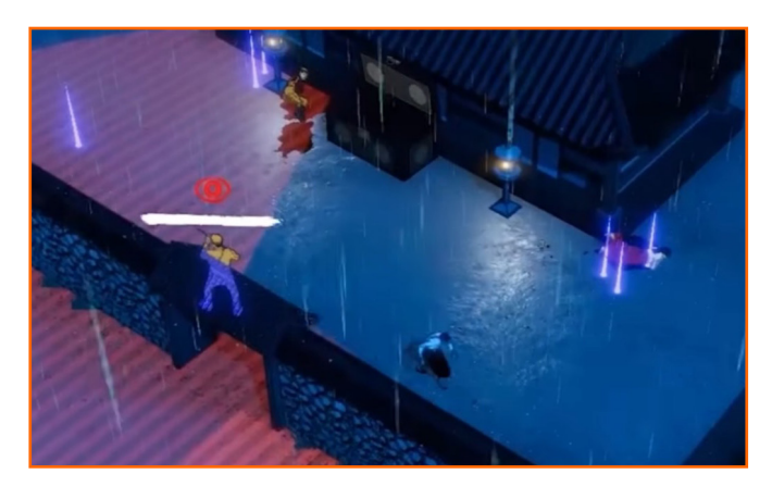
Figure 2. Capture from Wonhon: A vengeful spirit. Soldiers' red vision cone indicates that they are on alert

anese general. The tormented souls give the protagonist a series of missions that emphasize the brutality of Japanese soldiers who kill, torture and rape innocent victims. Some of them also allude to Korean independence fighters. Facing rising casualties, the Japanese soldiers hire a Korean shaman to end the situation, diversifying game mechanics since shamans require different approaches than other enemies to be dealt with. Overall, the gameplay reminds us of the popular saga Commandos created by the now-defunct Pyro Studios, particularly in its use of vision cones for the enemies, as can be seen below in Figure 2. Players have the ability to check an enemy's range of vision, which is represented by a green cone that may turn red whenever an enemy is alert, either because the player has been detected or because a corpse has been found. Due to its genre, what Chapman defines as "doing" is prevalent over the "reading" in this game, the narrative being mostly presented in the interludes between missions where players have conversations with the wronged souls requesting revenge. This approach contrasts with the games analyzed so far and may attract the attention of players less interested in the niche point-and-click adventure genre.