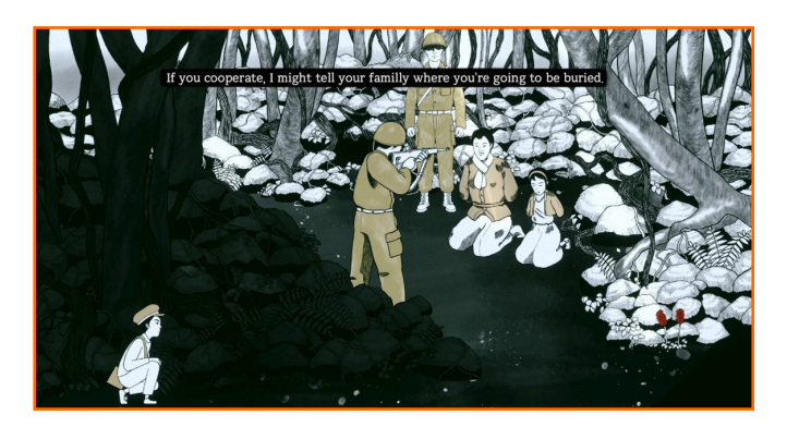
Figure 3. Herman hiding from soldiers in a capture of Unfolded Camelia Tales ' promotional trailer in Steam

Perhaps, Unfolded Camelia Tales is the simplest among the previously analyzed games in terms of "doing" because, although we need to accomplish a series of interactive tasks, they do not impact the development of the plot. The lighthearted dialogues and characters in most of the scenes contribute to making users feel a sharper contrast when the dark and tense moments related to its traumatic historical background unfold.