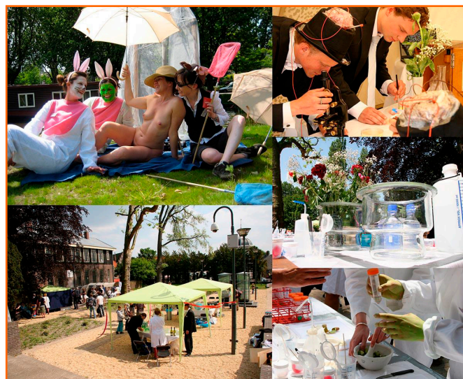
Image 3. InsideOut: Laboratory Ecologies, Museum Volkukund, The Netherlands. 2008.

To this end, I have developed a series of bioart public/participatory events through the INCUBATOR Lab that begin the process of imagining what our shared ecological biotech future could look like. I see my engagement with bioart practices as an experimental methodology. Each project is devised in a way that the outcomes are not assured. Instead, I provide a set of aesthetic, physical, environmental and social circumstances where a variety of participants and factors interacting with one another produce uncharted outcomes. I see these outcomes as propositions, as possible visions of our biotech future. In contemporary art circles this method is often described as 'social practice' (Thompson, Sholette, 2004) or 'relational aesthetics' (Bourriaud, 1998). In the context of bioart the participants are also non-human organisms, bringing anthrozoological considerations into the work.