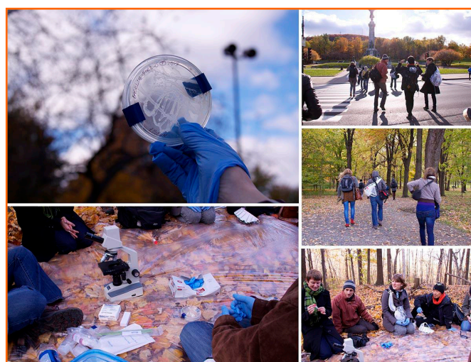
Cell Break, Fluxmedia Lab, Concordia University, Montreal, Canada, 2013

I often use frameworks gleaned from non-art and non-scientific human activities to engage artists/scientists and members of the public in a complex biotech species interaction. I often rely on existing human activities in the out-of-doors to create a non-threatening ecological environment for re-imagining our relationship to biotech species. For example, in 2008 I hosted a bioart picnic called "InsideOut: Laboratory Ecologies" (image 3) in collaboration with the Art and Genomics Centre at the University of Leiden in The Netherlands. In 2010, I conducted a series of day-hikes called "Cell Break" (image 4) where biotech specimens were taken on an out-of-doors excursion, a day hike in the Canadian Rocky Mountains