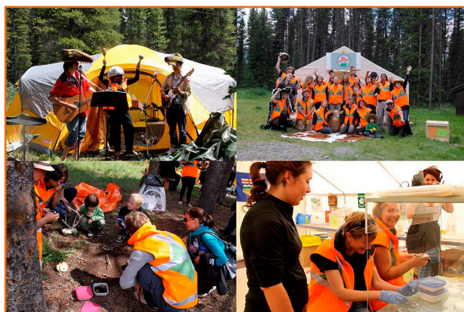
Image 5. BioARTCAMP: A Rocky Mountain Adventure in Art and Biology, The Banff Centre, Banff, Canada. 2011

In 2011, I invited 20 artists, scientists, and students to join me on a camping trip (and residency at The Banff Centre called BioARTCAMP (image 5) at Castle Mountain Hostel in Banff National Park, Canada. There we lived and worked with our biotech species, building a portable bioart lab in a tent in the forest at the foot of Castle Mountain. We conducted individual and collaborative art/science projects for a week, then opening up the camp to audience members from The Banff Centre, Calgary, the Banff town site, and local campgrounds. We hosted an “Art/Science Fair BBQ” with live music, games for families, a display of all the projects, and free food and beverages. BioARTCAMP served to manifest a unique interspecies interaction, exploring alternative research methods, outcomes and audiences. BioARTCAMP articulated for me that the human social organism is deeply significant, and must also be addressed if we are to successfully lend ourselves to a mutual co-productive relationship with the other organisms we share our labs (and our planet) with.