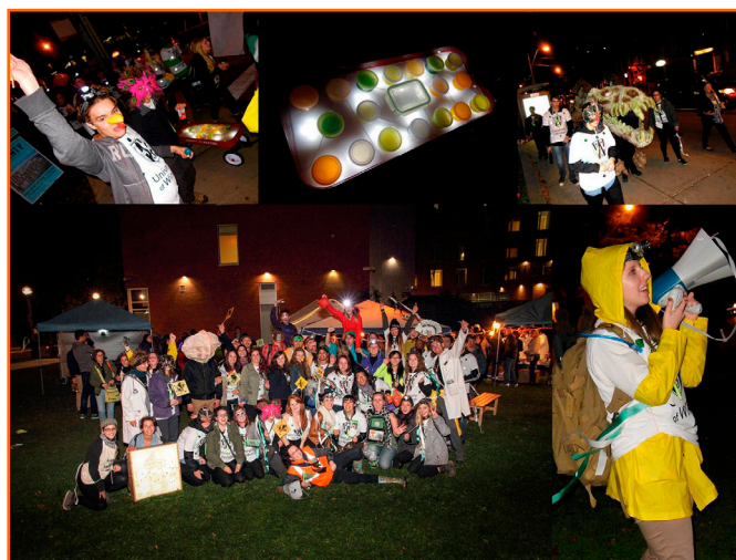
Image 7. Art and Ecology Parade, Arts Council of Windsor and Region, Windsor, Canada. 2012