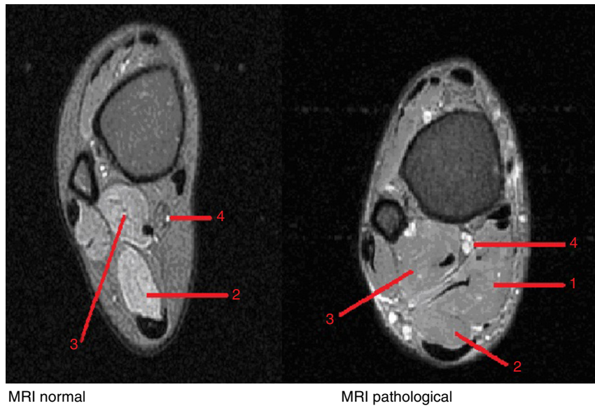
Figure 2 MRI. Comparative axial DP FS. Normal and pathological. 1. Accessory soleus muscle; 2. Soleus muscle; 3. Long flexor thumb; 4. Artery, vein and nerve posterior tibial.

plantar flexion. 4,5,8 It is accompanied by pain in 67% of cases 3 that gets worse with running and jumping. 4,8,10 These symptoms could be explained by the presence of compartment syndrome chronic caused by an increased size in the accessory muscle during activity. It can also cause a compression