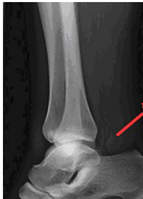
Figure 1 X-ray lateral ankle, obliteration of the Kager triangle for accessory soleus muscle.

Although it may be an incidental finding during imaging performed for an unrelated injury, 3,8 the typical presentation is a soft mass in the posteromedial distal third of the leg, which increases in size with physical activity especially with