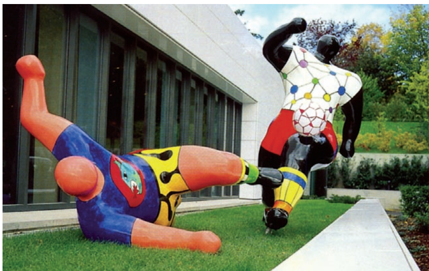
Figure 1 The Footballers , large-scale (1994).

Catherine Marie-Agnès de Saint-Phalle was born on 29 October 1930 in Neuilly-sur-Seine, France, where her American family, who were bankers by profession, found themselves following the financial ruin caused by the Great Depression at the end of the 1920s. She lived with her paternal grandparents for 3 years until she returned to Greenwich, Connecticut, with her parents in 1933. She began her education and artistic training in New York, where she lived until 1951. From 1937 onwards she was known as Niki de Saint-Phalle. During