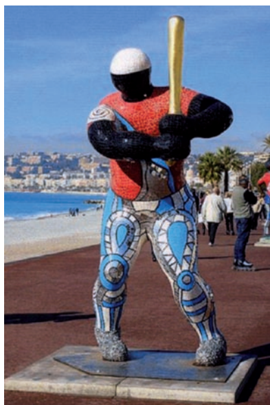
Figure 15 Baseball player. Nice (2002).