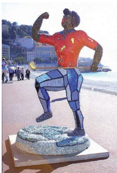
Figure 14 Golfer. Nice (2002).