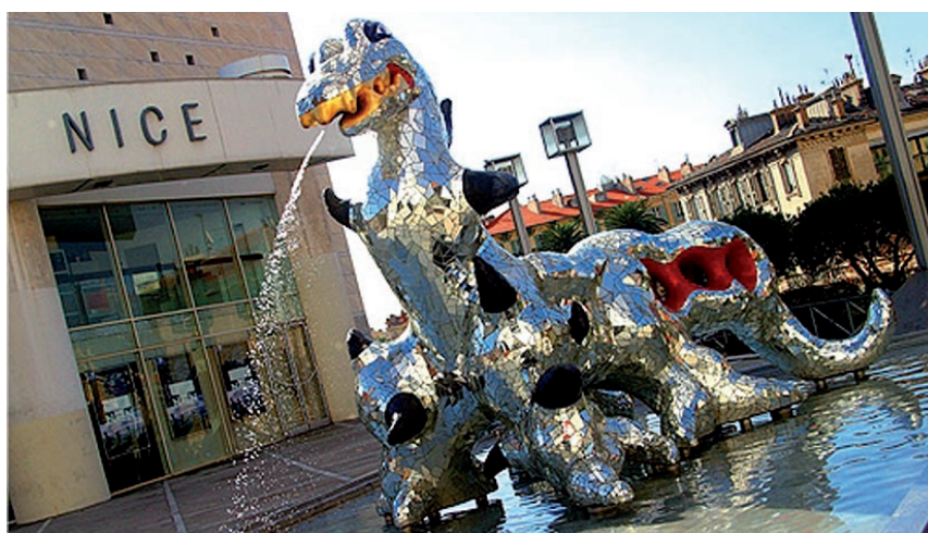
Figure 17 Loch Ness Monster (1993).

musicians, sportsmen and totems were exhibited in the streets of the city. One of these, the Loch Ness Monster that let out an endless stream of water from its jaws, was permanently placed in front of the museum in a square named after the artist herself. However, as a result of her continued use of polyester the artist began