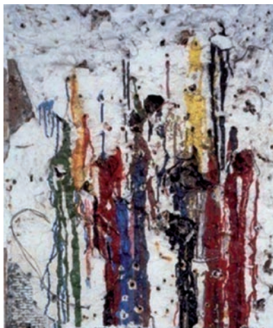
Figure 3 Shooting painting (1961).