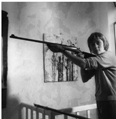
Figure 2 Niki de Saint-Phalle. Shooting (1961).