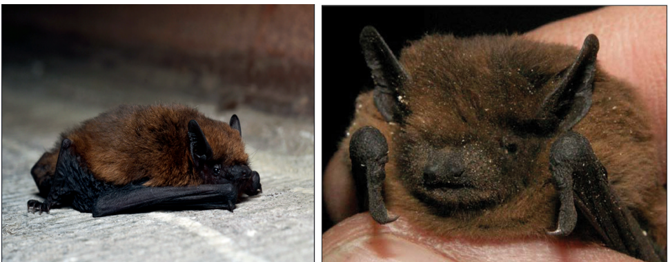
Fig. 4. Specimen of Pipistrellus kuhlii .

Two individuals of Rhinolophus ferrumequinum were observed in the Thour cave (fig. 5). This species is a common species in northern Algeria, found from the littoral coasts to