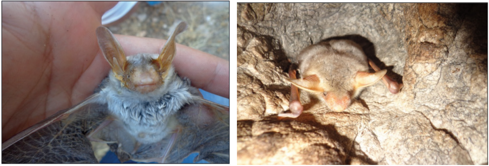
Fig. 3. Specimen of Myotis punicus .