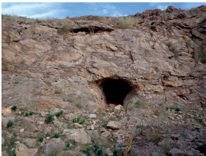
Fig. 2. Cave Dhib (D).