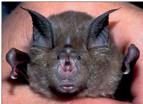
Fig. 5. Specimen of Rhinolophus ferrumequinum .

Fig. 5. Espécimen de Rhinolophus ferrumequinum.