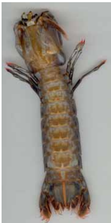
Fig. 2. Parasquilla ferussaci : male from Gavà (Barcelona) (ICMS_94/2007), dorsal view.