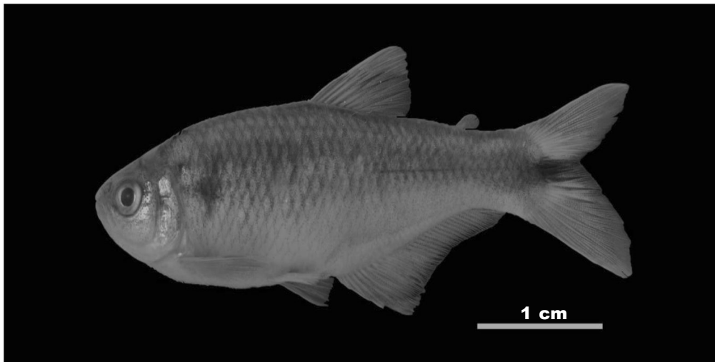
Fig. 1. Bryconamericus caldasi n. sp., holotype, male, IUQ 3714, 63.7 mm SL, San José County, La Libertad Creek, 200 m from La Libertad school on the San José, Arauca Road, Caldas, Colombia.

Fig. 1. Bryconamericus caldasi sp. n., holotipo, macho, IUQ 3714, 63,7 mm de longitud estándar, condado de San José, riachuelo La Libertad, a 200 m de la escuela La Libertad, situada en la carretera de San José a Arauca, en Caldas, Colombia.