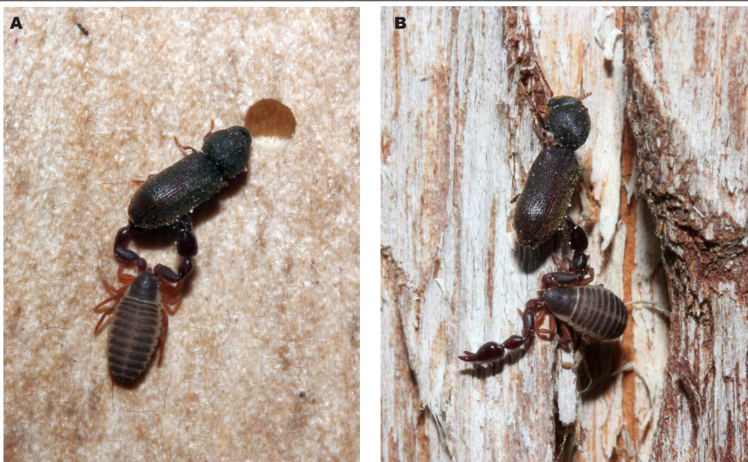
Fig. 2. Dendrochernes cyrneus hunting for Ptilinus pectinicornis females.