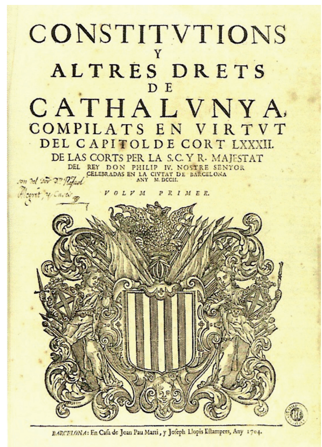
Figure 1. Minutes of the General Court held in Barcelona between 12th October 1701 and 14th January 1702 chaired by King Philip IV and V of Spain in Catalonia.

Outside the Francophile party in the Madrid Court, public opinion in the different Spanish kingdoms could not welcome the choice of a French candidate as their sovereign with open arms. And yet, this is what can be deduced from Charles II's will. It should be borne in mind that the hostility between the Spanish monarchy and France had been constant throughout the previous two centuries. And the same could be said of the rivalry between the Austrians and the Bourbons, and two dynasties that vied for European hegemony throughout the entire 17th century. To some extent, after Westphalia (1648), the ascent of one of Louis XIV's direct descendants onto the Spanish throne cemented the definitive victory of both France and the Bourbons in that drawn-out conflict.