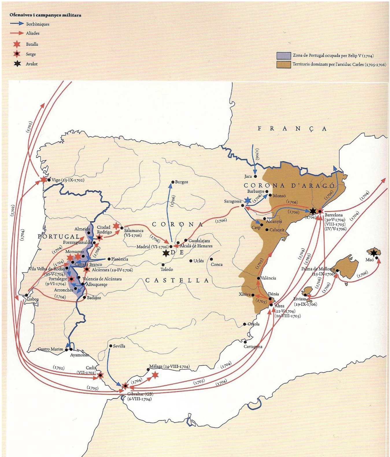
Figure 2. Map of the War of the Spanish Succession, 1702-1706 (from Catalunya i la Guerra de Successió . Museu d'Història de Catalunya, Barcelona 2007).

pressions in the country where, in theory, the grievance was supposed to be resolved. The activation of the Portuguese front with Charles III's arrival in Lisbon had ended in utter failure. And the allies' indisputable naval hegemony on the Iberian coasts had only secured Gibraltar, which became like a presidium with its back turned on